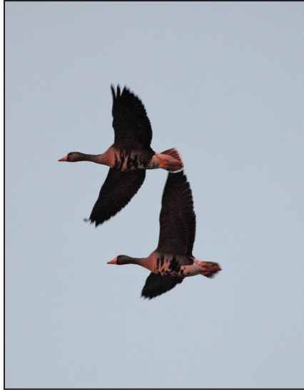
The objects of affection.

you of a biker in camouflage, except for the fact that his demeanor is as easygoing as Tim Allen's character in the movie Wild Hogs .