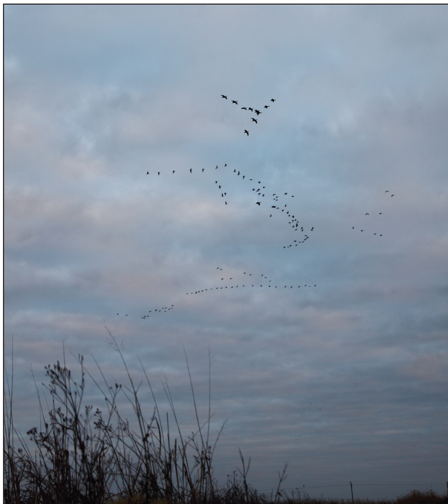
Daylight, and flocks of geese, over the rice prairie.