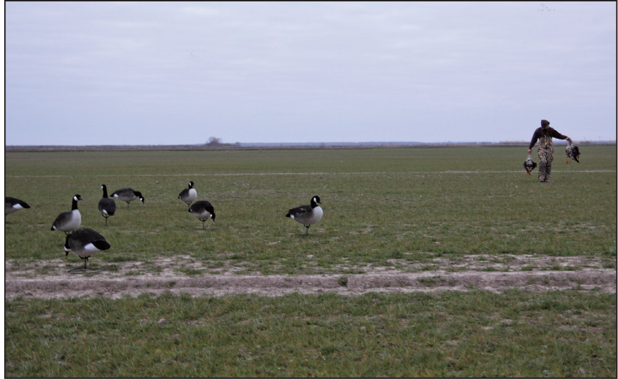
Daniels bird dogs a pair that fell beyond the Canada decoys.

One mistake that some duck and goose outfitters do on a regular basis is leave their decoys out. The birds get extremely used to seeing these waterfowl